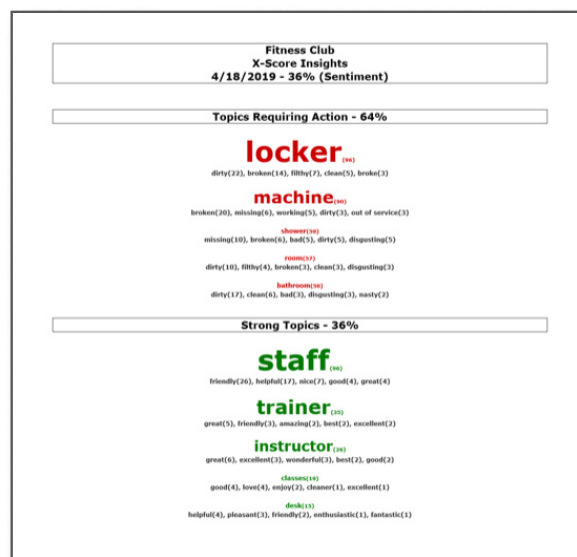
X-Score Insights Report